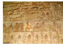
Beni Hassan Tomb Painting